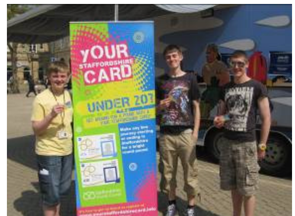
Staff & young people promoting the 'Your Staffordshire Card' in Newcastle and in Stafford